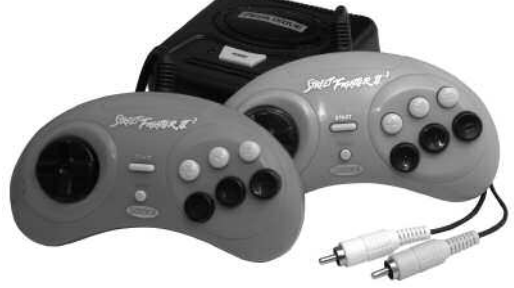
Model 75030 For 1 player / Ages 8 and up INSTRUCTION MANUAL