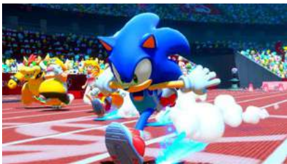
ILLUSTRATION PURPOSES ONLY. PRODUCT MAY CHANGE.