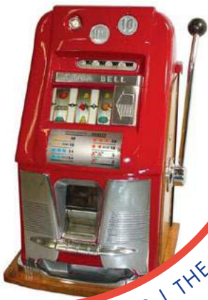
1940 | THE BEGINNING