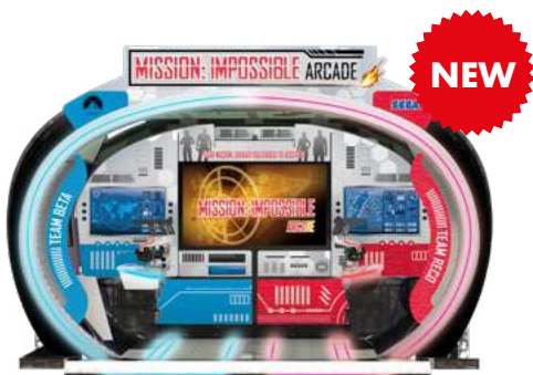
ILLUSTRATION PURPOSES ONLY. PRODUCT MAY CHANGE.