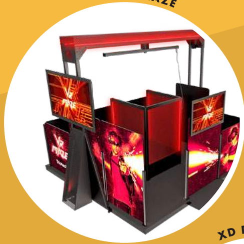
XD DARK RIDE