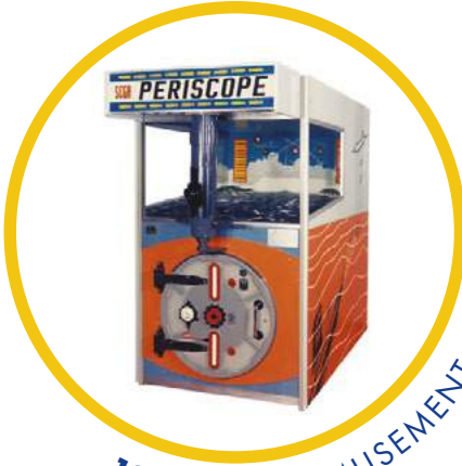
1966 | 1ST AMUSEMENT MACHINE