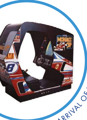
1970's | ARRIVAL OF VIDEO