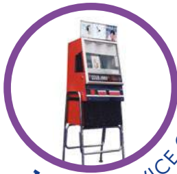
1952 | SERVICE GAMES