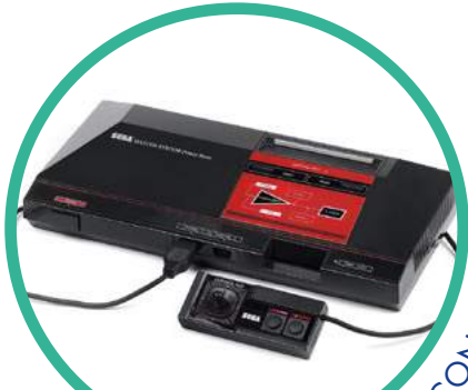
1980's | HOME CONSOLE