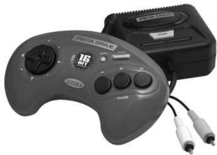
Model 75020 For 1 player / Ages 8 and up INSTRUCTION MANUAL P/N 82390210 Rev.B