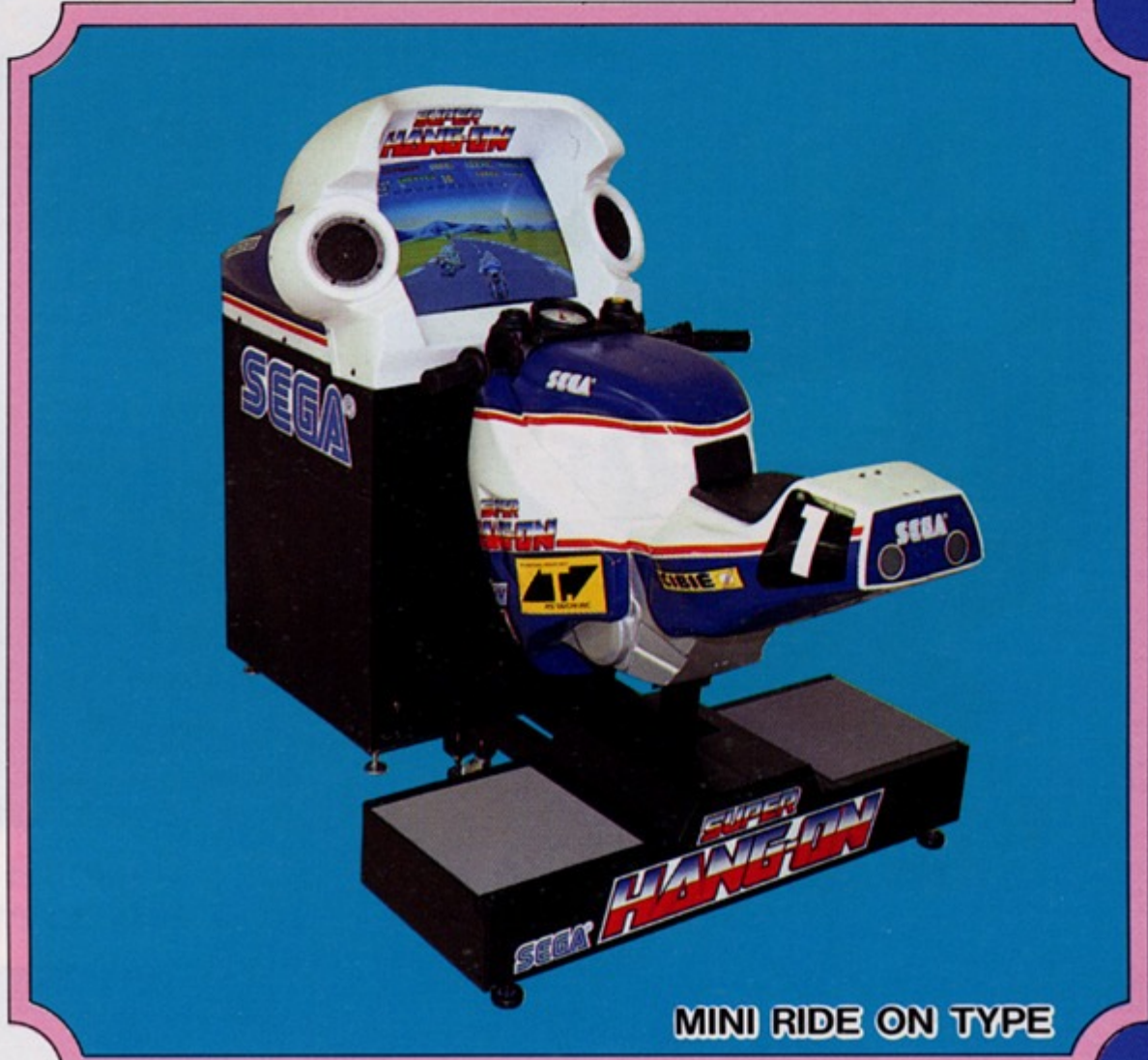
MINI RIDE ON TYPE

Realistic conditions and even up & down surfaces all contribute to make the SUPER HANG-ON a truly first-class motorcycling game.