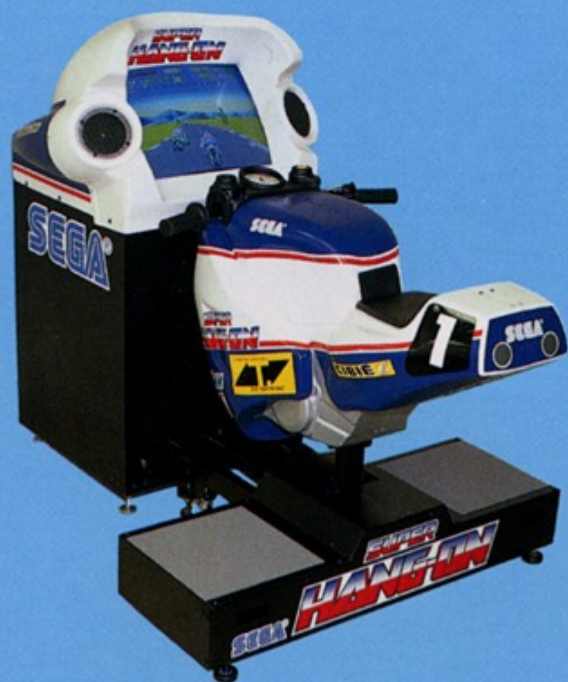
MINI RIDE ON TYPE